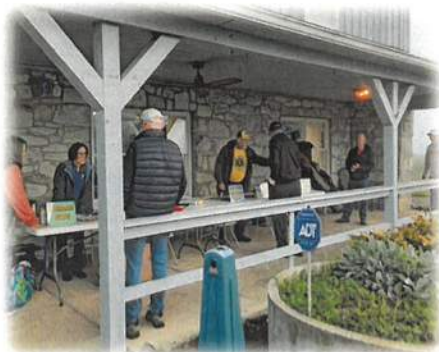
Registration started at 7:30 am. Donuts and coffee was available

Thanks to all those Lions and Alumni who showed up and helped make the event a great success!