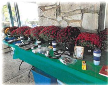
Golfers received tickets to claim these prizes worth as much as $150!