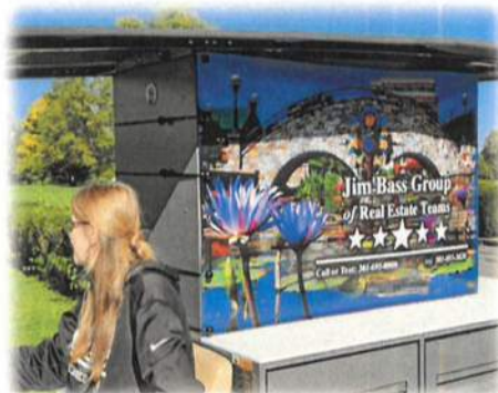
This was the first year for the Drink Cart Sponsorship—the cart is shown here and was all over the course much to the delight of the golfers