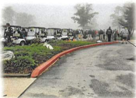
Golfers were in their carts and got instructions from the club pro here