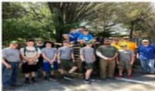
Scout Troop # 735 Helpers

18 th ANNUAL MULCH SALE SATURDAY, APRIL 06 & 13, 2024